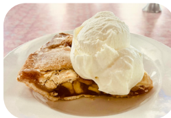
Apple Pie Ala Mode

Sundae – Choose your flavor! • 4.50 (Hot Fudge, Strawberry, Caramel, and More!)