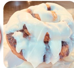
Giant Hot Cinnamon Roll

Oatmeal & Fixin's – Bowl of oatmeal with a side of brown sugar, milk and raisins • 6.50