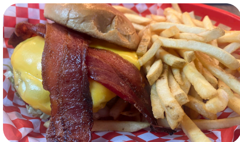
Bacon Cheese Burger

Ask your server about our Shake of the Month!